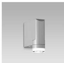
oneway - opal