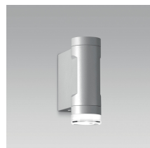
twoway - opal + blade