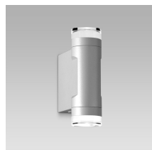
twoway - opal