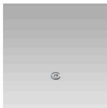
trim above the ground