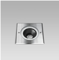
squared trim above the ground

Size: 11" 27/32 to 11" 31/32 7" 3/4 to 8"