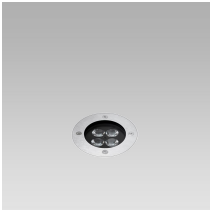
round trim flush with ground