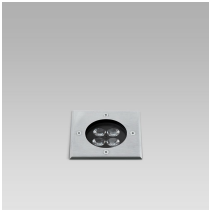
squared trim above the ground

Size: 4" 23/32 2" 11/16 to 2" 7/8 7" 15/32