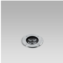
round trim above the ground